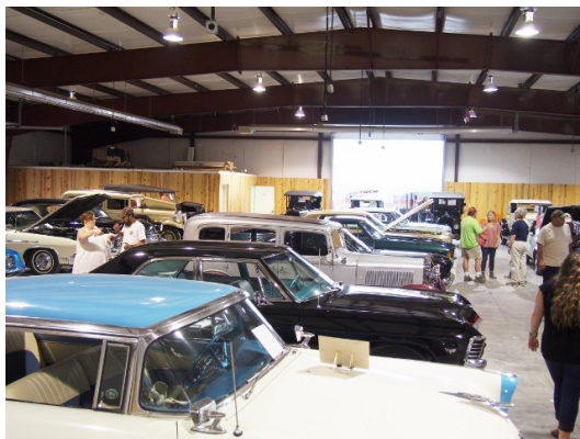
Spectator traffic was steady all during the show—much better than in 2016.