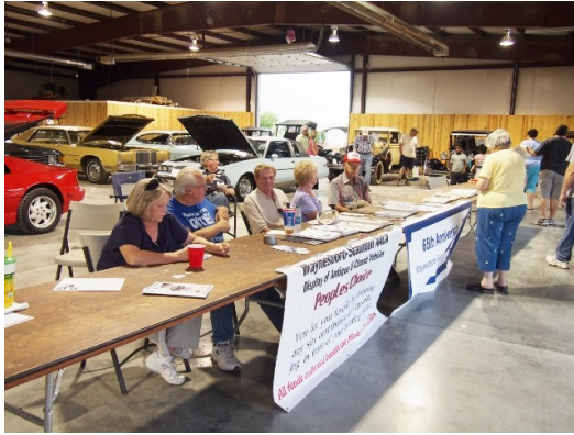
Members manned the info. tables throughout the display.