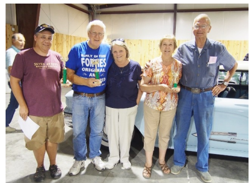
Our winners at the trophy presentation.