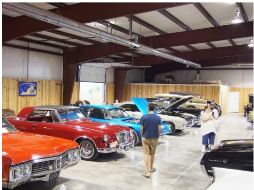
Cars built from 1924 through 1990 were on display.