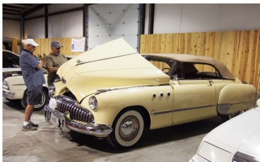
Jim Gregory shows a visitor the straight eight of his 1949 Buick Super Convertible.