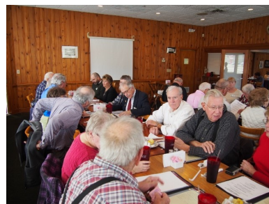
Member's gathered ready to enjoy the good food at Rowe's.