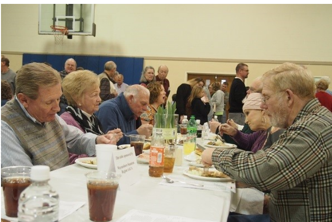
Some of our crew enjoying the pork dinner and all the fixings. Some even had 3 desserts!