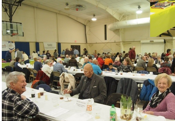
The crowd awaits the winners of the auction.