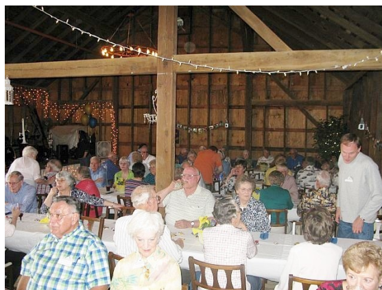
Scenes from our 65 th