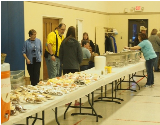
The buffet tables is being stocked. Note all the desserts.