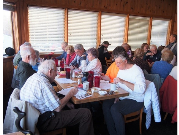
Members always enjoy the menu at Rowes.