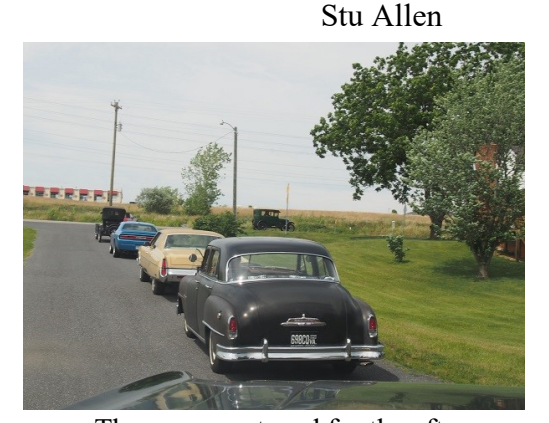
The cars are staged for the after picnic tour. (June Meeting and Tour)