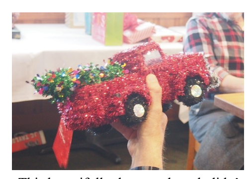
This beautifully decorated truck didn't stay very long with Rick Downs.