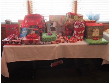
The gift table was filled with goodies.