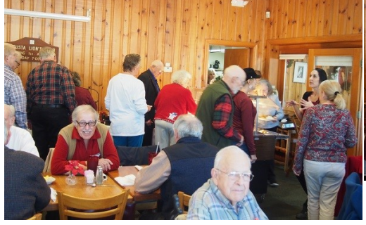
Folks line up for the buffet. Nobody leaves the AACA meetings hungry!