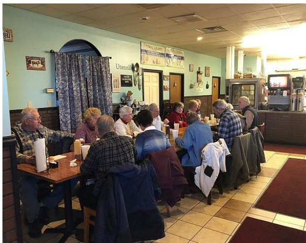
There were two full tables of hungry folks at Sunday's meeting.