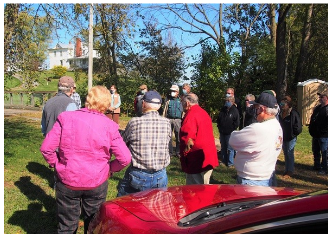
Our group listens to the knowledgeable tour guides about the history and operation of the mill.