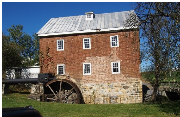
The Breneman-Turner Mill. Built in the early 1800's and in operation until 1988.