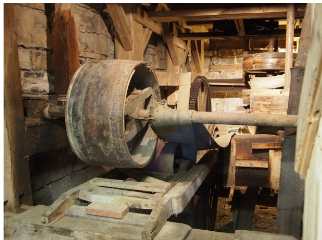
Some of the massive machinery powered by water and the large mill wheel.