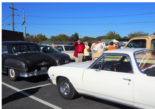
W-S Members gather at the Verona Post Office for the Fall Tour.