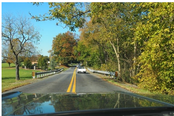
On the road through the scenic countryside with Fall colors. (Somebody has to be last!)