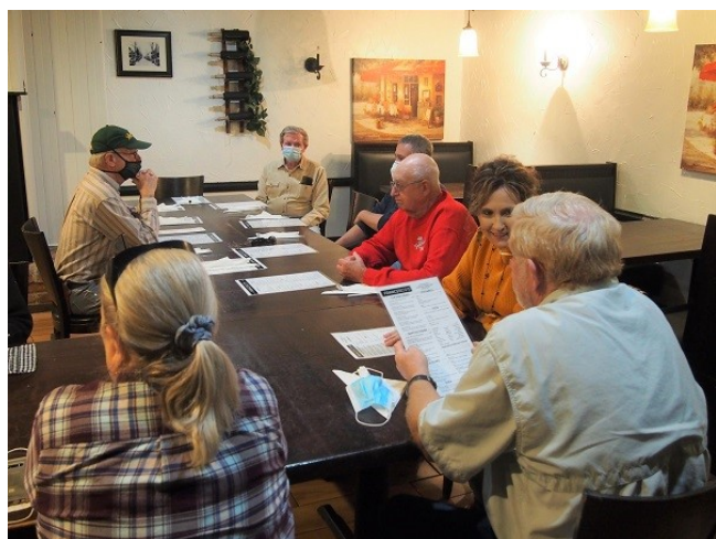
Lunch was at Francesco's Italian Restaurant in Bridgewater.