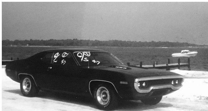
Jack’s Road Runner at Fort Walton Beech, Florida - Morning after running the drag strip

It was July of 1971 and I was in my 440 powered 4 speed Road Runner at 9 PM traveling along a huge expanse of straight as an arrow highway with the tires barely touching pavement and just about to enter Panama City, Florida. Blue lights, pull over and two gorilla’s exit a Florida Highway Patrol car, one trooper on either side of my car. I roll down the window and the driver says, “Boy, you’re in Florida and you’re going to the gulag for going 90MPH in a 30MPH zone. License and registration before I ‘cuff you!’ I’ll give them credit being quite straight and forward as I’d heard of these tactics before. “OK Mr. Drago, explain why you’re driving a Florida car with Georgia plates, with a Massachusetts license and a New Hampshire address?” Explanation given and the Trooper driver says “hang on” and shuts off the Blue lights. I figured they were going to toss me off the bridge we were on and into the Atlantic Ocean. He pops the hood on his cruiser and says they can’t go any faster than 110 MPH and could I fix it so it goes faster. “YES SIR, you just bring the car to me at 8 AM at (name withheld) in (name withheld) on Thursday morning and I’ll have this thing running that’ll scare you out of your wits.”