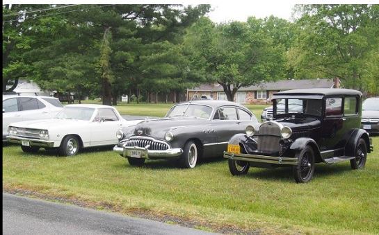
In spite of the drizzle, some old cars made the meeting.

The day started out a bit on the soggy side but was cloudy and dry for our meeting. The threatened rain may have discouraged some from attending but we still had a good turnout. Many members had not seen each other for over a year! Great food and at last, some much needed fellowship.