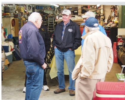
The guys catch up on the latest car stories.