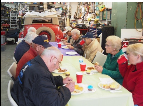
Jim's garage converted to a dining room shared with a great Franklin.