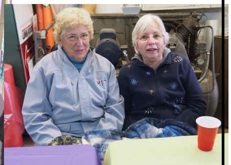
Some of the ladies felt that blankets were in style.