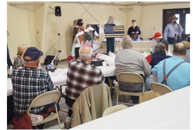
Watching the live auction.