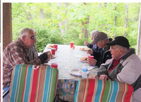
Oh the stories they tell!