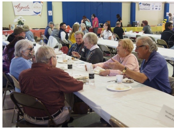
The gang enjoys the good food!