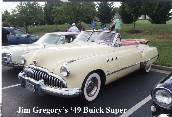
Jim Gregory's '49 Buick Super