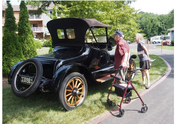
Baldwin Park residents and staff check out the cars.