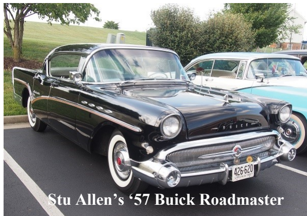
Stu Allen's '57 Buick Roadmaster