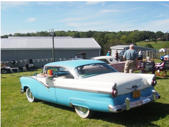
Jack Drago's 1956 Ford Victoria

Your Editor's 1917 Buick parked near to a 2021 Corvette. Quite a contrast!