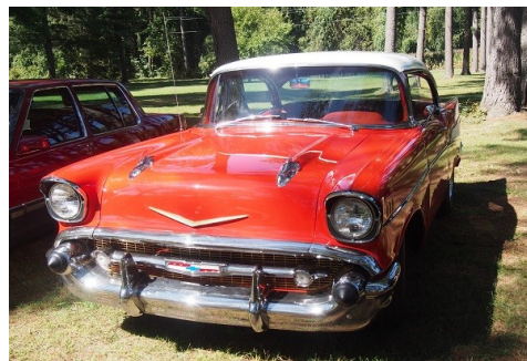
The Skillmans’ 1957 Chevrolet 2-dr hardtop. A big trunk was required to haul all their auction purchases!