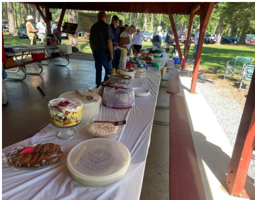
There’s always plenty of food at our gatherings.