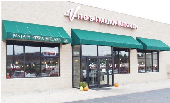
Vito's is located on to Port Republic Road close to the exit off I-81.

Ourgoing V.P. Patty Watson-Gregory took us to a new venue, Veto's Italian Kitchen in Harrisonburg where we all enjoyed excellent food and fellowship.