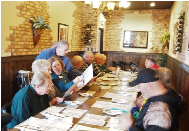
The gang studies the extensive menu. Lots of selections that got good reviews.

For our annual "Show & Tell" we had some interesting items.