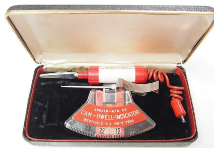
The second item was an AC tool to adjust distributor point dwell on or off the car.