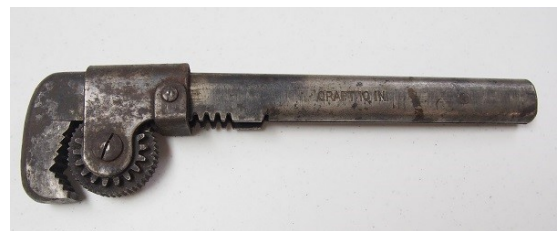
Your Editor brought a strange adjustable wrench that was an early Craftsman tool patented in 1906.