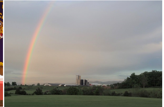
This was the beautiful sight that greeted us as we finished the cleanup after a very enjoyable Anniversary Celebration