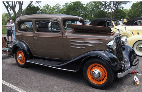
Your Editor received his first Repeat Senior Award for his 1934 Chevrolet Master 2-Dr.