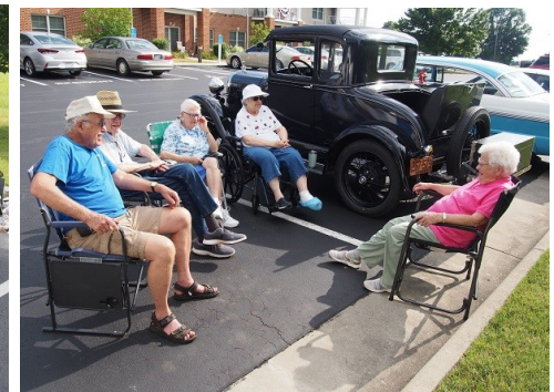
Members enjoyed fellowship with Community residents.