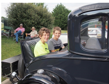
Future Car Guys try out the Model A's rumble seat.