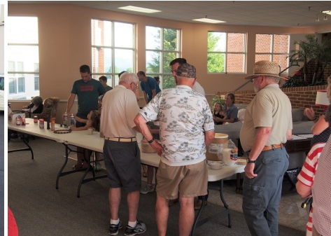
Nothing beats ice cream on a warm summer night.