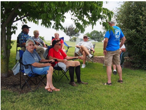
W-S Members enjoy the shade on a warm July night.