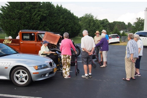
Residents came out in force to view our vehicles.