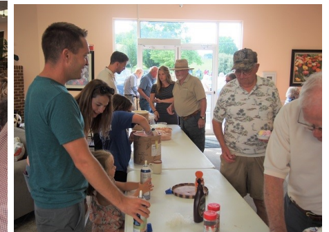
It was tough to choose among all the toppings offered.