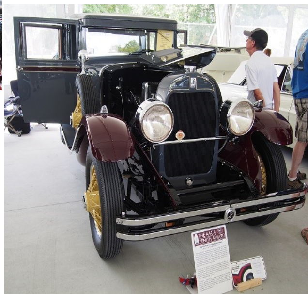
2022 Zenith Award Winner—1929 DuPont