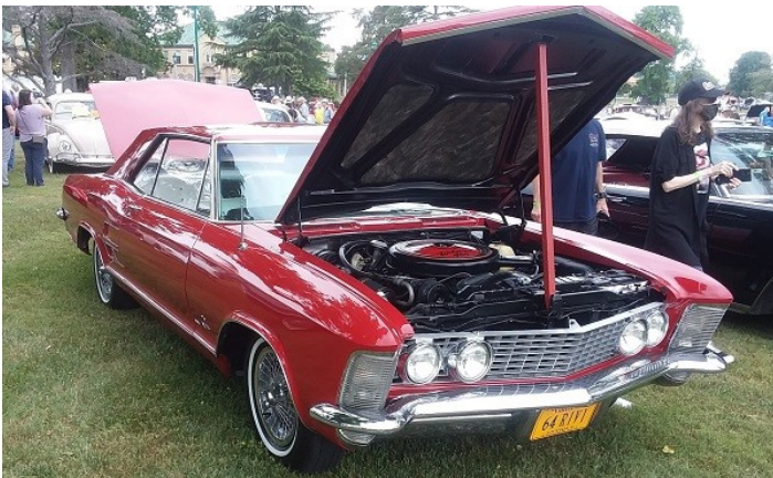
1966 Buick Riviera