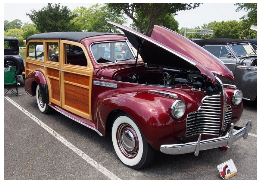
1940 Buick Station Wagon