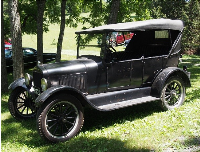
Nelson Driver's 1927 Ford Model T Touring

22 Members enjoyed beautiful weather and delicious food at the pavilion.