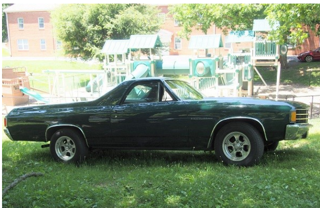
Glen Royer's 1972 Chevrolet El Camino