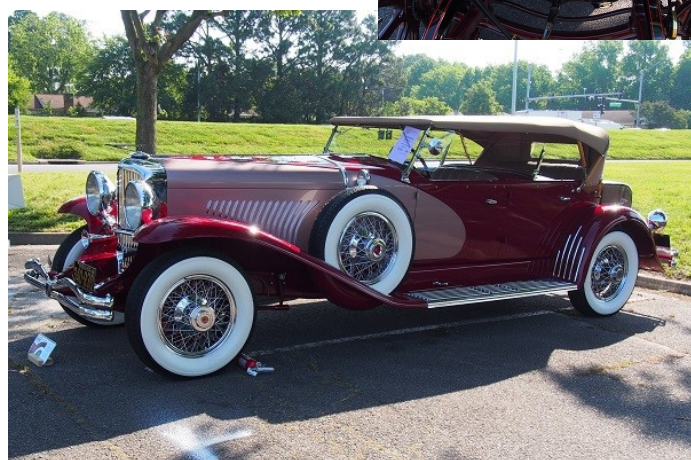
1930 Duesenberg J