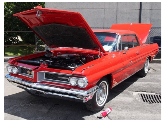
Tommy Nolen's 1962 Pontiac Grand Prix -Repeat Preservation

Another HPOF Buick (1958 Century) was parked nearby. This car had no power steering or power brakes! Great exercise driving this one!