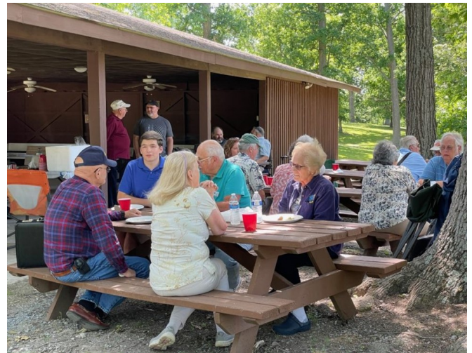
Good food, great fellowship and nice weather. What's not to like?