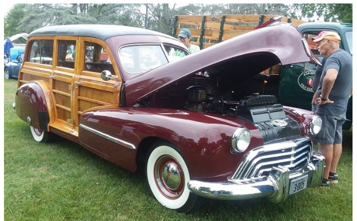
1947 Oldsmobile Woody Wagon