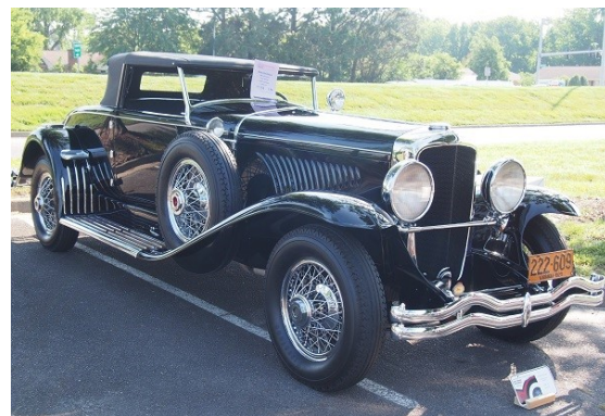
1929 Duesenberg J

A beautiful day to look at 350+ award winning cars.