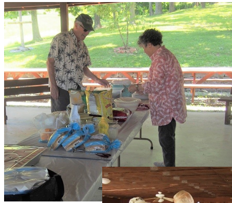
Members get the picnic buffet set up.