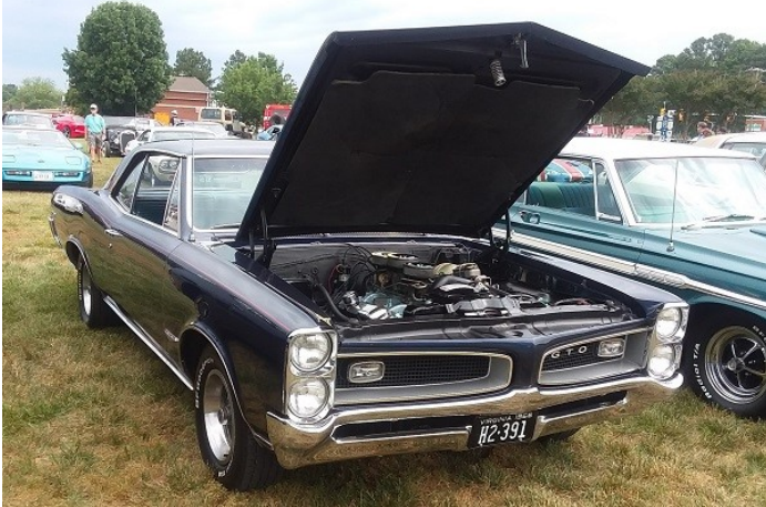
1966 Pontiac GTO