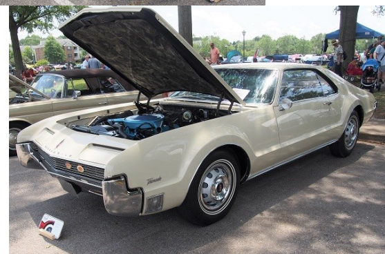
1966 Oldsmobile Toronado Coupe