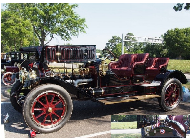
1911 Thomas Flyer