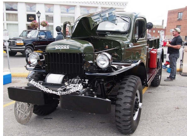
1948 Dodge Power Wagon -First Junior