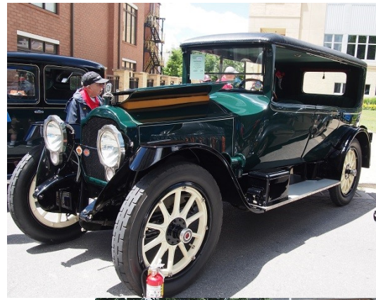
1915 Packard 12-Cyl. Limo. Repeat Preservation

Downtown Beckley W.V. was the site of the 2022 Eastern Spring Nationals hosted by WV Whitewater Region. The weather had cooled off to the low 70's as about 150 cars gathered on closed -off streets. Judging started at 11 AM and the cars were released from the show field at 3PM. The Awards Banquet was held at the nearby Tamarack Conferenc Center where at least 125 awards were presented after a delicious meal and all was completed by 8 PM.