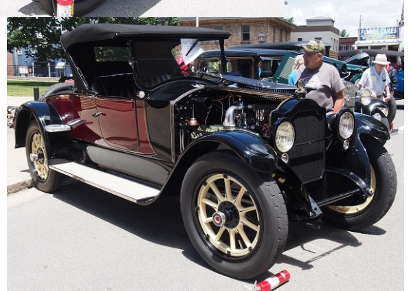
1920 Packard Twin-Six First Junior