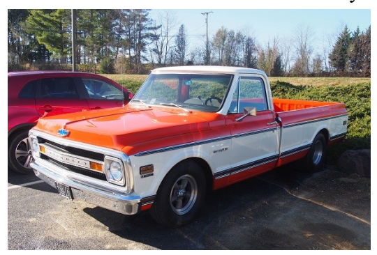
Nobody knew the owner of this 71/72 Chevy Pickup. Neat ride!